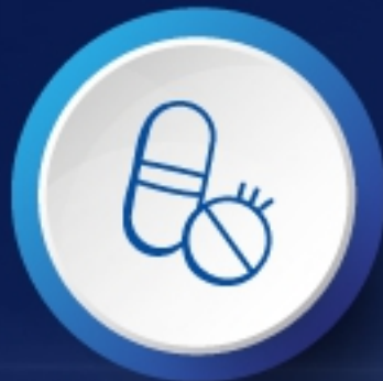
Pharma & Healthcare

We are experts in designing the solution for your convenience to get the best possible outcome thus creating a strong hold in market. Below are the mentioned fields for your reference.