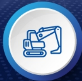
Mining & Construction