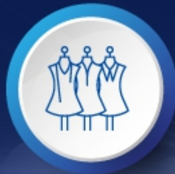
Fashion & Apparel